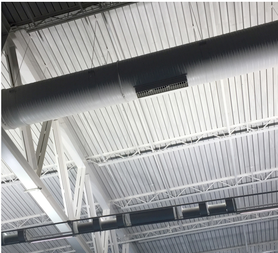
The factory-finished joists provide support for the HVAC ducts that outline the perimeter of the natatorium.