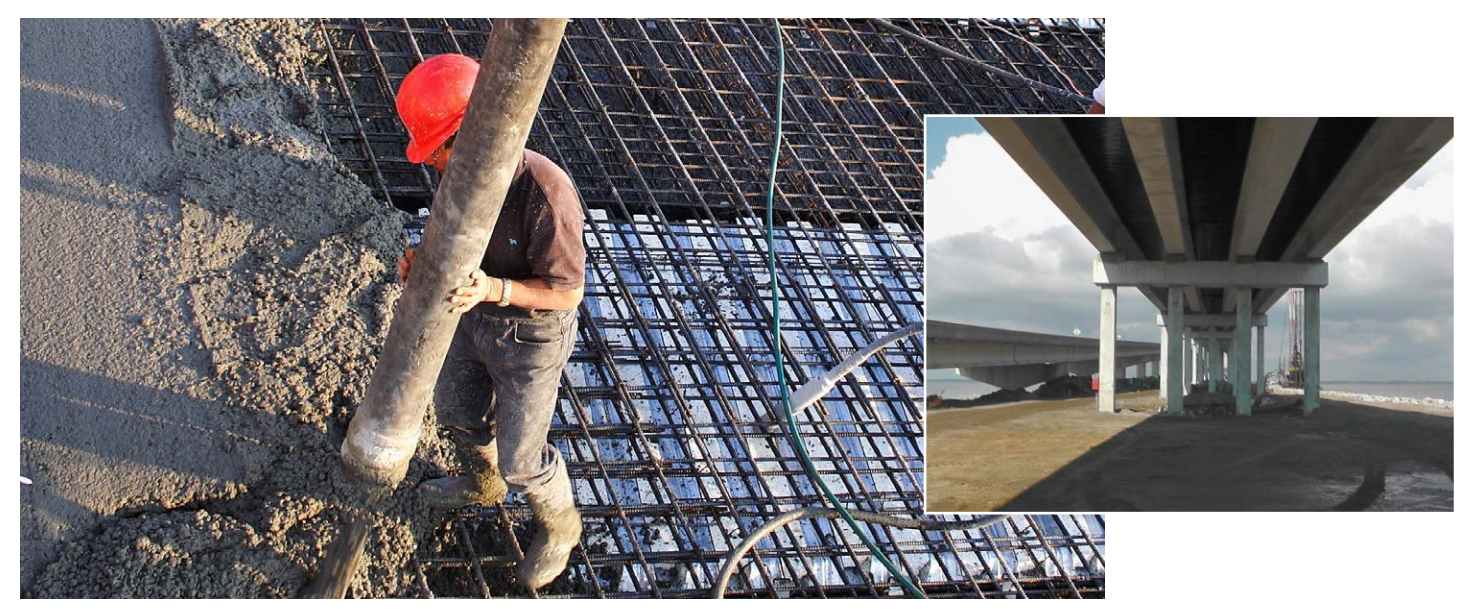
New Millennium's Bridge-Dek<sup>®</sup> and Rhino-Dek<sup>®</sup> stay-in-place steel form systems allow project owners to reduce costs by 20-25%, compared to wood forms.

We took a look back at the last year of Roof-Lines "Did You Know" articles to recap what we think are the not-to-be-missed top five pointers. Click on the "Read More" links to read the complete article: