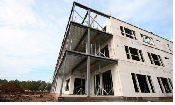
The Versa-Dek<sup>®</sup> system permits an open-floor plan design with the required strength to withstand the elements.