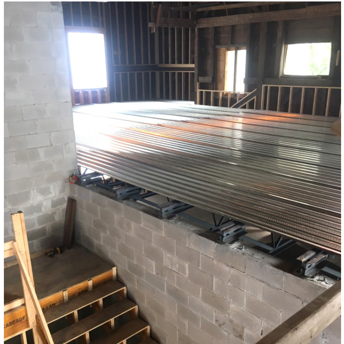
1.5CD standard composite deck sits atop steel joists in preparation for the concrete floor to be poured.