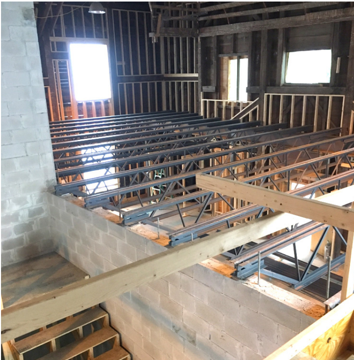
New Millennium steel joists span the existing infrastructure of the shell of a 1830s church in Beverly, MA.

features that makes structural solutions from New Millennium Building Systems so versatile. They can integrate into wood, steel, or whatever existing structure is found on site,” says Bill.