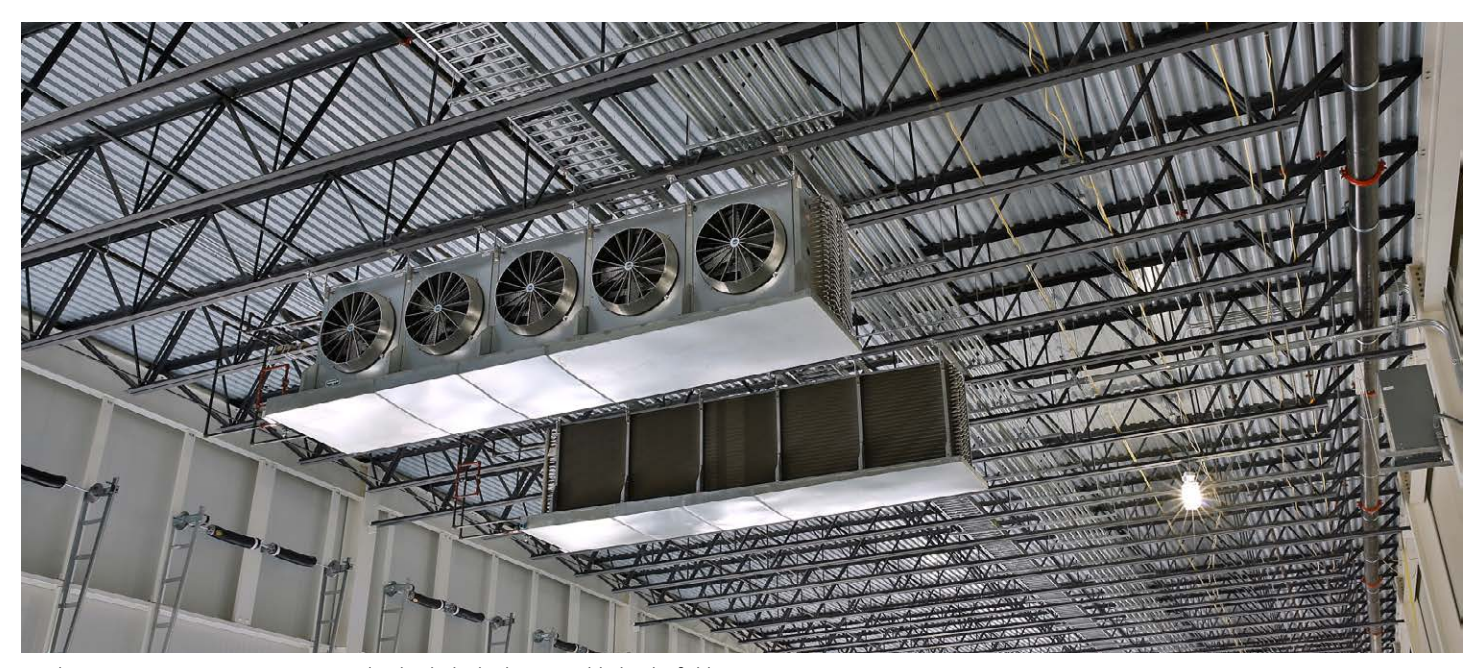
Single-piece joists can span up to 120' and with a bolted splice assembled in the field can span up to 240'. As a roof or floor system, they are capable of efficiently supporting nearly any demand imposed upon them.