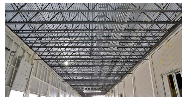
MEP integration is seamless with open-web steel joists.

The SJI, in its video "An Introduction to the Steel Joist Institute," calls joists "far superior in weight and costs to their monolithic counterparts." The open-web design means Standard Steel Joists use less steel than beams, which reduces cost and weight (consequently the joist support system also can be lighter-weight), and enables single-piece joists to span up to 120'.