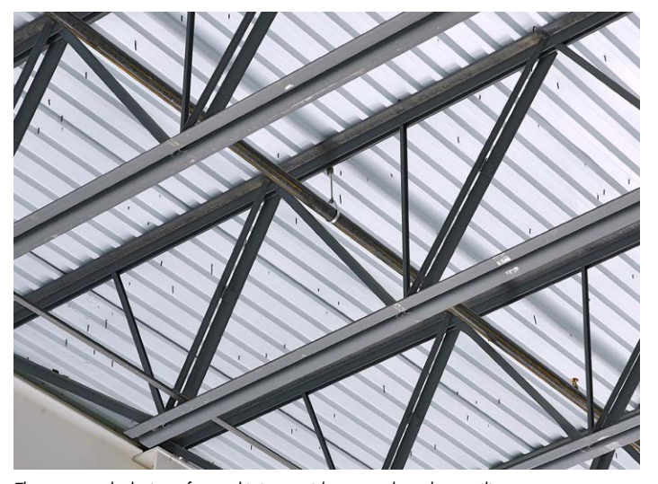
The open-web design of a steel joist provides strength and versatility.

Standard Steel Joists derive their strength from their efficient design. The top and bottom chords of a joist form the flexural capacity to resist vertical gravity and wind uplift loads while the webs handle the vertical shear forces. Different joist sizes can handle different loads. The trailing number in a joist designation (e.g. the 10 in 30K10) indicates a relative chord size. From that chord size, a flexural capacity can be determined, and the uniform load capacity is then derived for a given span. That is the basis for the standard SJI load tables. A 30K8 joist has larger chords than a 30K7 joist, thus it has a larger flexural capacity. The uniform load capacity of the chords published in the SJI tables is then used to design the web members along the length of the joist for the vertical shear forces resulting from that load along the span. On a uniformly loaded joist, the shear forces are greatest at the ends of the span, and smallest at the mid-span. The web members are sized accordingly—higher capacity at the ends and smaller capacity near the middle. As the uniform load and/or the span of a joist increases, so do the shear forces, and the required web member sizes.